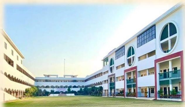
Junior & Senior Blocks