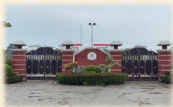
Elegant Main Gate Entrance