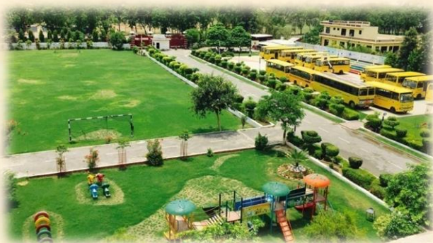
Soothing Lush Green Campus