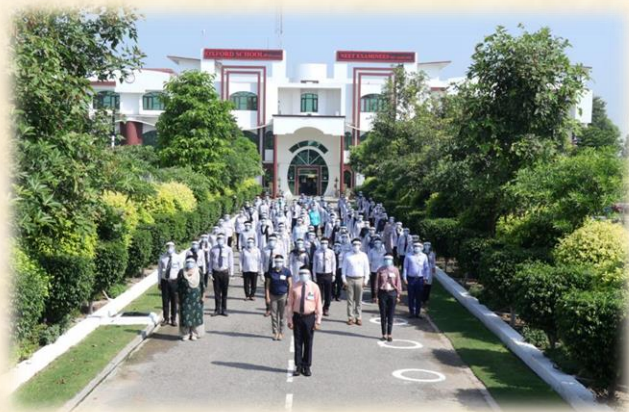
Eye-Catching Drive Way